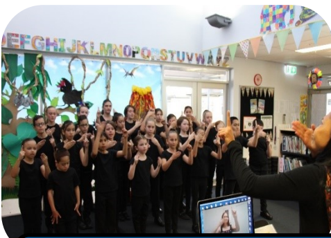
Recording the 2020 virtual CGEN performance due to COVID.